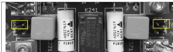
Nominal Gain Setting