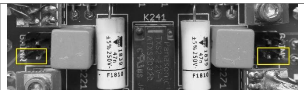
Maximum Gain Setting